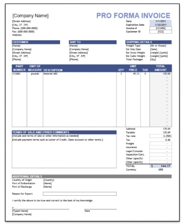
FIGURE 2 PRO FORMA INVOICE

Pro forma invoices (see Figure 2, Pro Forma Invoice) are not used for payment purposes. The pro-forma invoice should include two statements. One that certifies the pro forma invoice is true and correct and another that gives the country of origin of the goods. The invoice should also be marked "pro forma invoice."