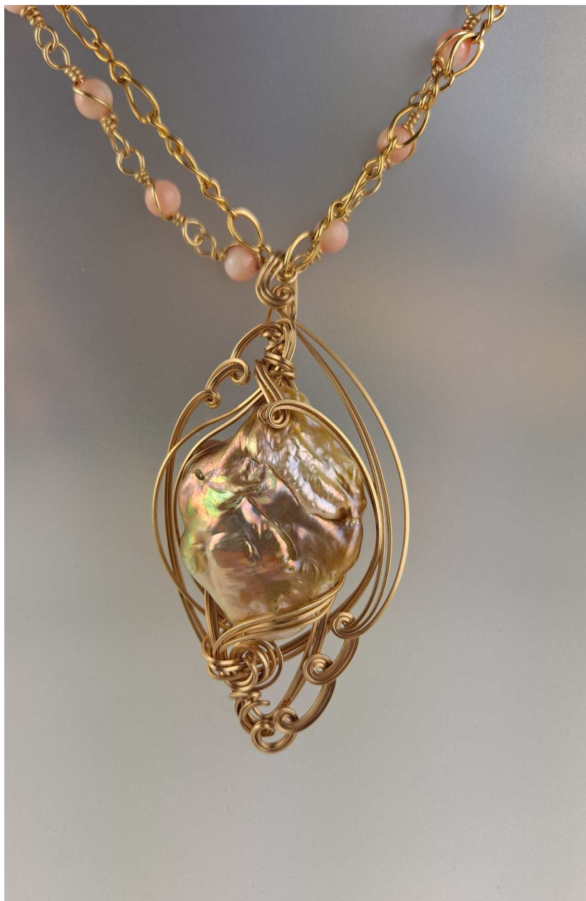
Coral Necklace with Removable Baroque Pearl Enhancer

Baroque pearls symbolize wisdom and attract wealth and luck as well as protection. They are also thought to symbolize the purity, generosity, integrity and loyalty of the wearer.