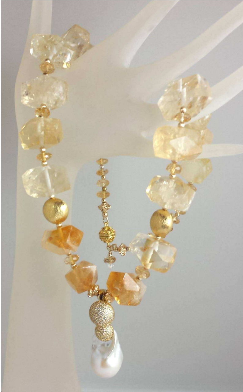
Citrine Nugget Necklace with Removable Baroque Pearl Enhancer Magnetic clasp by Nina Designs

Citrine is thought to attract wealth and became known as the merchant's stone since merchants would often keep one in their cash box.