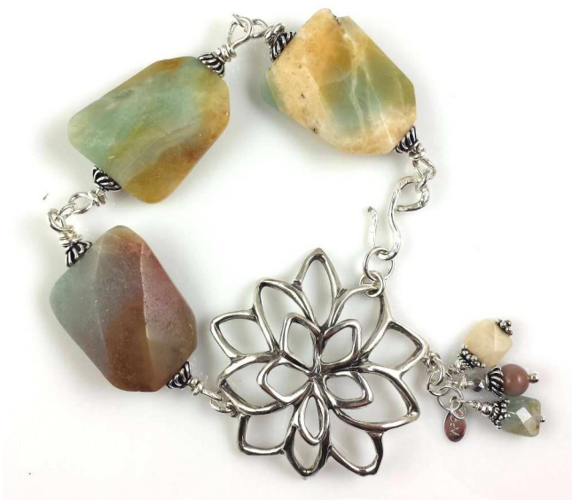
Amazonite Bracelet with Sterling Silver Accents