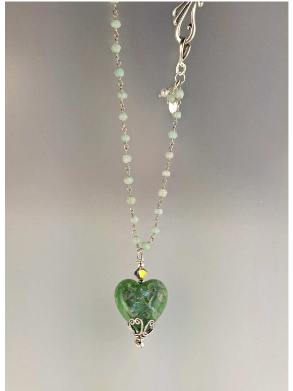
Lamp work Heart with Aquamarine Beaded Chain and Sterling Clasp