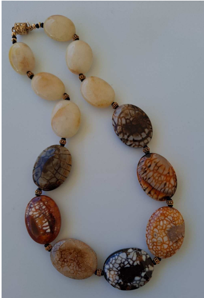
Mexican Fire Agate Necklace with Honey Jade and Black Zircon Accents