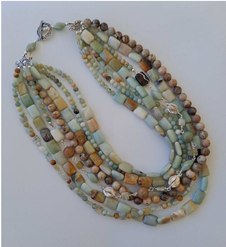
Amazonite Necklace with Accents of Fossilized Agate, Aquamarine, Aventurine, and Sterling Silver

Amazonite is said to be a stone of truth, honor, communication, and integrity. It's also thought by some to enhance intuition, creativity and intellect.