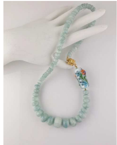
Aquamarine and Lamp work Necklace Private collection

I have enough jewelry.....said no-one ever!