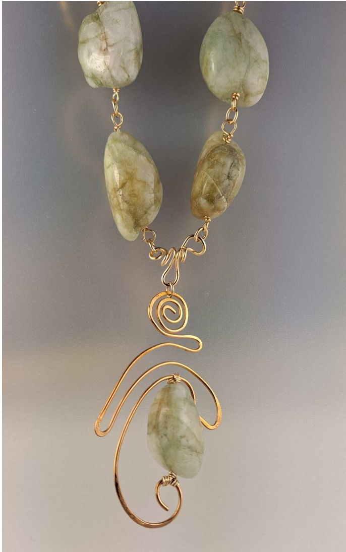
Aquamarine Nugget Necklace with 14kt Gold- Filled Accents