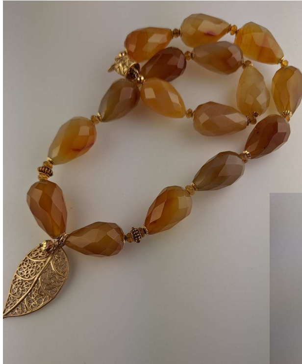
Faceted Natural Carnelian Necklace with Citrine Spacers

Carnelian boosts ambition and the courage needed to overcome difficulties.