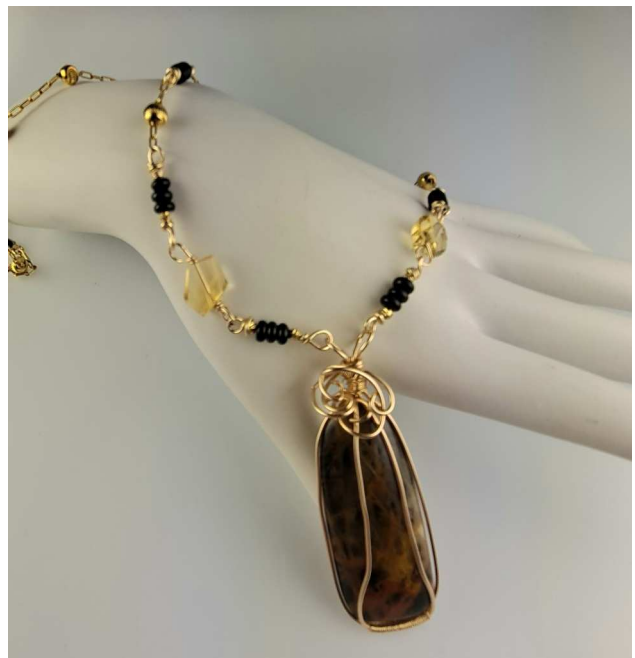
Rare Cheetah Agate with Citrine and Black Onyx Accents

Owls are considered to be symbols of wisdom and knowledge..