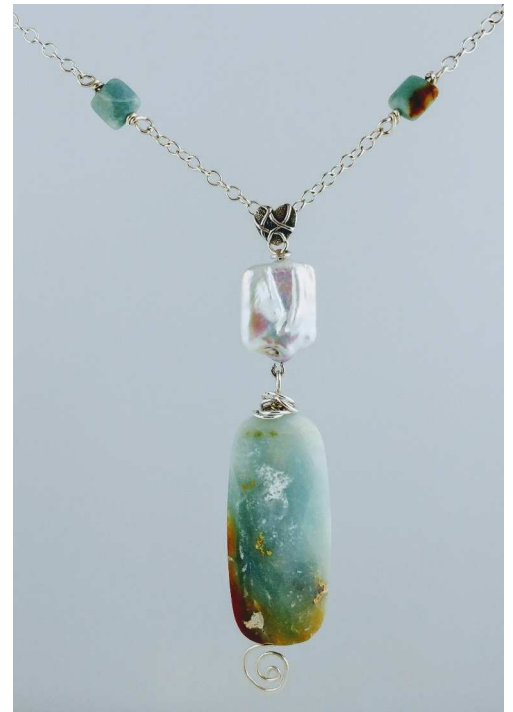
Amazonite Pendant Necklace with Freshwater Pearl