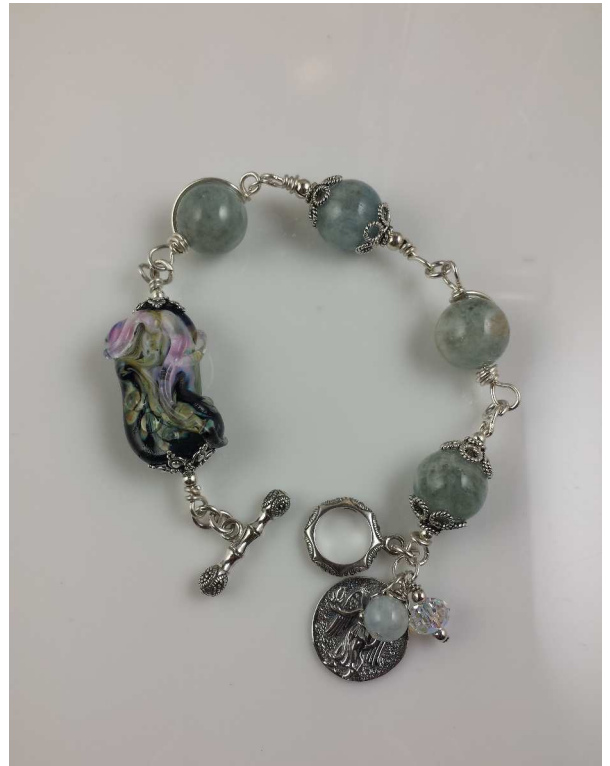
Aquamarine, Sterling and Lamp work Bracelet