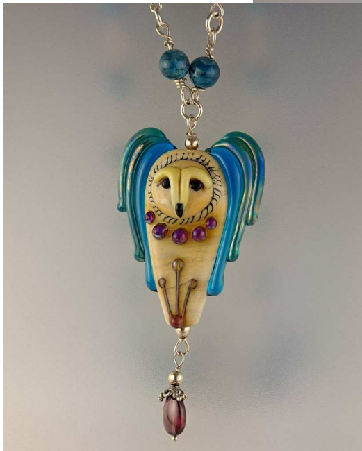
Apatite Beaded Necklace with Lamp work Focal Lamp work Owl bead by glass artist, Viktorija Vait

"Beauty begins the moment you decide to be yourself." Coco Chanel