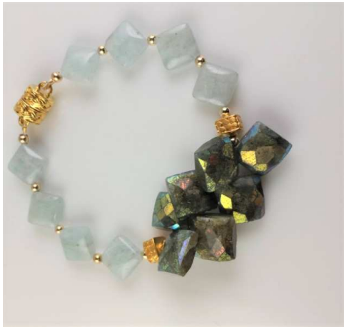
Aquamarine Bracelet with Labradorite