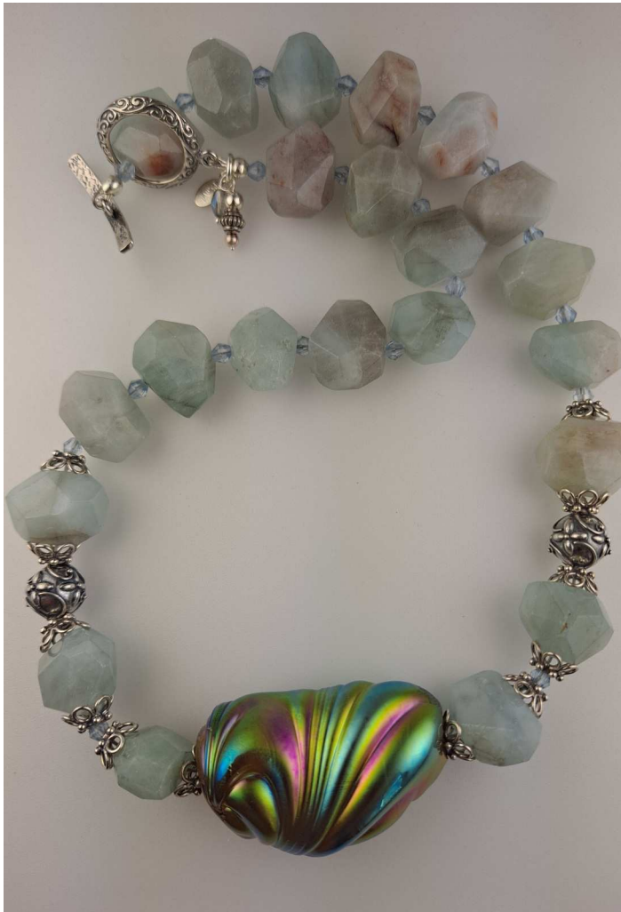
Aquamarine Faceted Nugget Necklace with Tiffany Style Glass Focal and Sterling Silver Accents

Aquamarine is a symbol of good luck and protection. Some call it the mermaid stone, as it was thought to bring good luck to sailors and guarantee them a safe voyage.