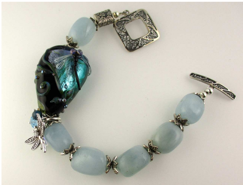
Aquamarine Nugget Bracelet with Lamp work Focal and Sterling Silver Accents